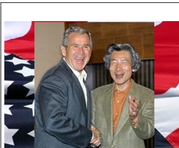
President George W. Bush and Prime Minister Koizumi Junichiro, July 2006

the kernel of the relationship. Not until the rise of the Democratic Party 40 years later did that change, when the “ zokkoku question” merged with the “Okinawa question” (on which below).