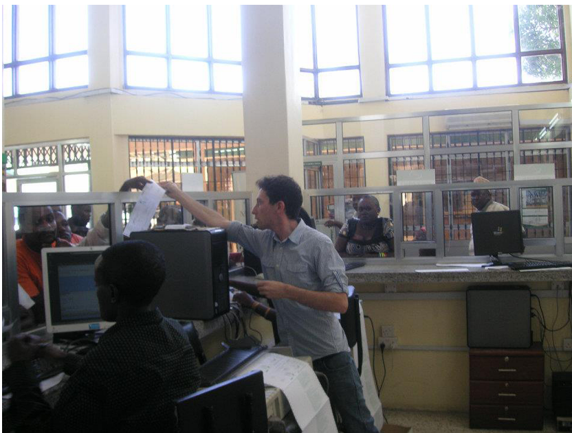
Figure 1. The author hands out electricity bills at a TANESCO branch office

With its sunlit glass windowpanes and vast open ceiling, the Kinondoni North branch office of TANESCO provides a spacious, climate-controlled alternative to the equally bright, but hot and dusty, world outside. As part of a broader traineeship that cycled me through various TANESCO departments and field crews, I spent about three weeks working at the branch office's billing kiosk printing out and handing bills to residents whose households had conventional, that is, post-paid meters (see fig. 1). After snagging their bills, they headed laterally to a long, snaking line up to the payment window. The flow of people from billing kiosk to payment window mirrors the current-currency circuit: the amount of power consumed is the input, and the amount paid is the output. Ideally, there is correspondence: one uses Tsh. 50,000 worth of current for private consumption or economic development (and not, for instance, as a commodity for resale) at a D1 tariff, and one pays that much to TANESCO (and not, say, to the touts and scammers that hung out outside). But in any given month, hundreds of residents never showed up to the office. Bills were never printed and payments never rendered. In such cases a journey might look more like Tsh. 50,000 consumed and