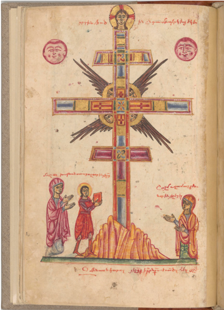
1.2. Embellished cross with donors, MS. M749, fol. 9 v. Gospel book; written and illuminated in Van, Armenia, in 1461.

these regions in the late antique or medieval period that does not take into account their presence and importance is incomplete and inadequate. In turn, and partly due to this rediscovery, Eastern Christian Studies – especially in the languages of Syriac, Coptic, Armenian (Fig. 1.2), and (Christian) Arabic – has experienced a renaissance and is entering something of a golden age, akin to the great flourishing it experienced in the late nineteenth and early twentieth centuries.