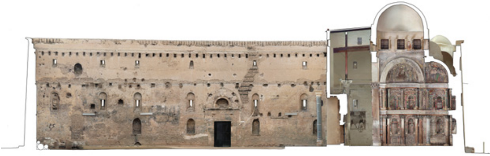
1.10. Red Monastery Church, section looking north, c. late fifth century. Laser scan drawing by Pietro Gasparri.