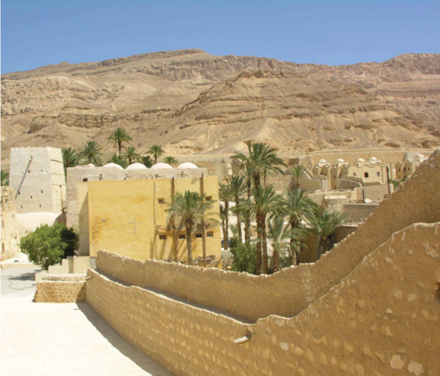
1.4. Monastery of St. Antony at the Red Sea, general view of interior.

fact, to query the purview of Byzantine Studies. Is Byzantium something that is defined politically and linguistically? What has been the role of modern ethnic nationalism – Greek, Slavic, Arab – or religious sectarianism – (Chalcedonian) Orthodox, Catholic, Islamic – in giving shape to the field and determining, explicitly or implicitly, who and what are included or excluded? 4 Is Byzantium to be identified with the imperial church (the Greek Orthodox Church) or should it include all Christian (and non-Christian) confessions originally a part of the Eastern Roman Empire? 5 To what degree is East Rome itself, before or after the Arab conquests, too restrictive a matrix for eastern groups that continued to claim some affiliation with the Byzantine Empire, politically, confessionally, or notionally?