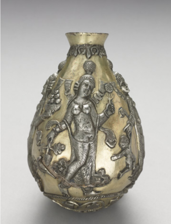
1.6. Anahita Vessel, 300–500 CE. Sasanian, Iran. Silver, cast, raised, repoussé, and gilded. Cleveland Museum of Art, Gift of Katherine Holden Thayer 1962.294.

The implications for the study of Byzantium of our alternative, expanded perspective are broad: approaches which privilege Greek, Chalcedonian Orthodoxy, Constantinople, imperial history, and the perspective of the metropole more generally, will be undermined and seen as incomplete and, indeed, as potentially elitist and exclusionary. 11 In their place, we offer a multicentric, polyglot, multi-confessional alternative whose geographical expanse includes all of the languages, traditions, and peoples of the Roman-ruled lands of the eastern Mediterranean and Near East, as well as areas and communities (such as the Sasanian Empire (Fig. 1.6), Georgia, or the Christian kingdom of Ethiopia) that were engaged with ideas that spread from within the Roman world. By emphasizing cultural connections, the mobility and transfer of people, objects, texts, ideas, and patterns of communal organization across linguistic and political boundaries, we put at the center of Byzantine Studies a world ripe for comparative study and we attempt to inject an enormously rich new set of materials and texts for study into the Byzantine canon.