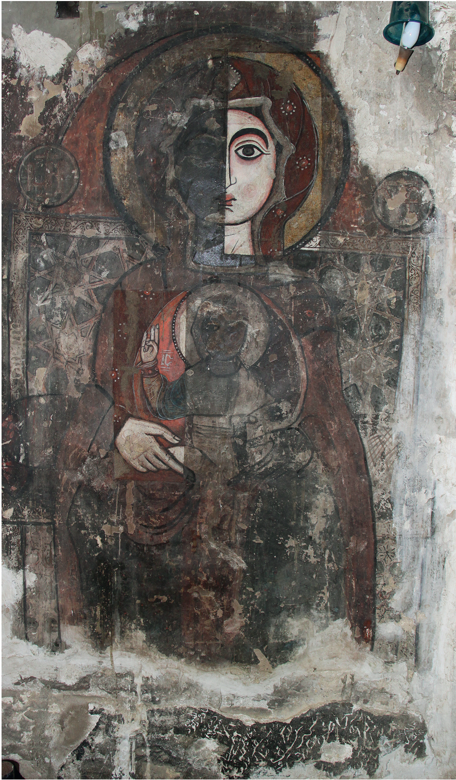
1.1. Theotokos during conservation, sanctuary, White Monastery Church. Secco painting, c. early fourteenth century.