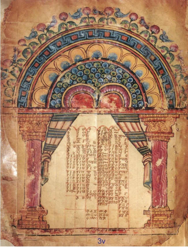
1.9. Canon Table, Garima Gospel I, 530–660 CE. Abba Garima Abbey, Tigray, Ethiopia.

address Christian communities, we see them as central to how Eastern Christians created and protected their collective identities and voices in the late Roman and early Islamic Near East. Our remit demands this breadth. In addition, like the Eastern Christians, Judaism and Islam reached a classical articulation, in some measure, in relation to a broader Byzantium. Third, and more programmatically, we focus on communication, trade, and the transmission of ideas, recognizing the lesson of global history that geography cannot alone define the study of the Byzantine Near East.