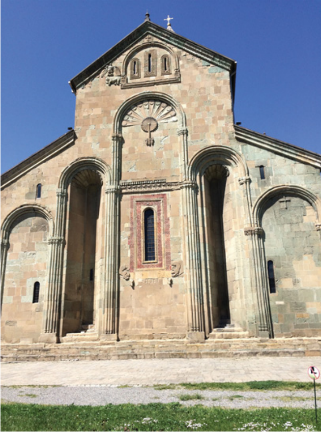
1.15. East façade, Svetitskhoveli Cathedral, Mtskheta, Georgia, eleventh century.

more firmly to its Near Eastern context. At the same time, the imprint of the Roman Empire on the Near East, even in memory, is indelible. Byzantine authority was linked to emperor and patriarch throughout, and we lose something if we ignore the role played by the Byzantine Empire and the Orthodox Church in Europe and the Near East alike. 59 That said, the notion of “Byzantium,” in its fullest sense, is a moving target. The Roman legacy is only one part of its role in shaping the Near East, both Christian and not. Highly diverse topics – yeshivot , Egyptian monasteries, liturgical objects, Jerusalem liturgy, Islamic origins – all fall under the purview of Byzantine Studies precisely because they depend, in part, on Byzantine categories for their existence and preservation and, crucially, for their study today.