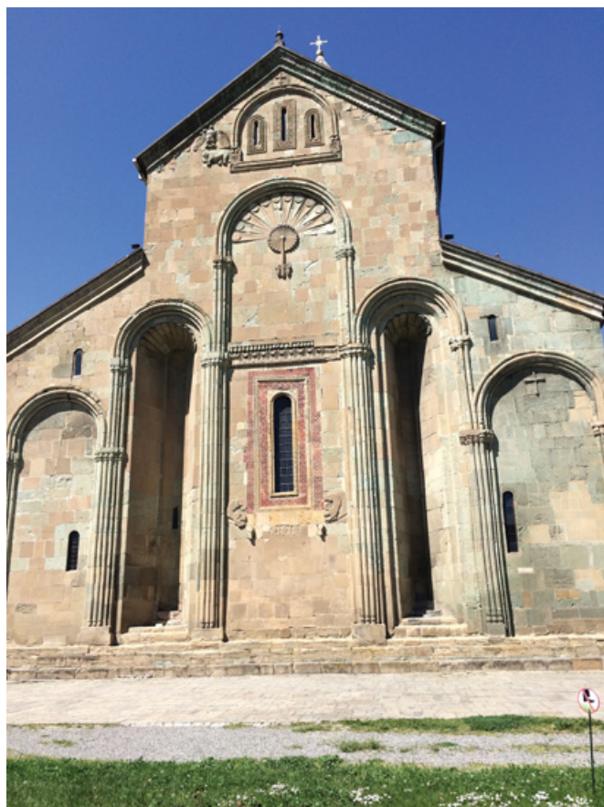
1.15. East facade, Svetitskhoveli Cathedral, Mtskheta, Georgia, eleventh century.

more firmly to its Near Eastern context. At the same time, the imprint of the Roman Empire on the Near East, even in memory, is indelible. Byzantine authority was linked to emperor and patriarch throughout, and we lose something if we ignore the role played by the Byzantine Empire and the Orthodox Church in Europe and the Near East alike. 59 That said, the notion of “Byzantium,” in its fullest sense, is a moving target. The Roman legacy is only one part of its role in shaping the Near East, both Christian and not. Highly diverse topics – yeshivot , Egyptian monasteries, liturgical objects, Jerusalem liturgy, Islamic origins – all fall under the purview of Byzantine Studies precisely because they depend, in part, on Byzantine categories for their existence and preservation and, crucially, for their study today.