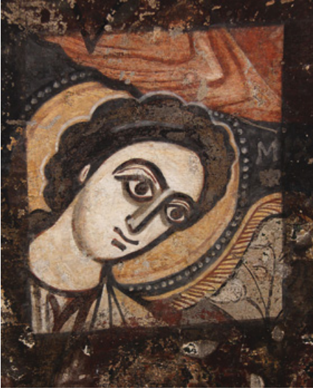
1.3. Angel, detail of head, Phase 4, Eastern semidome, Red Monastery Church, c. sixth century.

groups to the south and east of the Byzantine Empire? We understand that comprehensiveness is impossible, including in the present book, but the acknowledgment of this broader continuum may, we hope, reorient expectations about what Byzantine Studies is and can achieve.