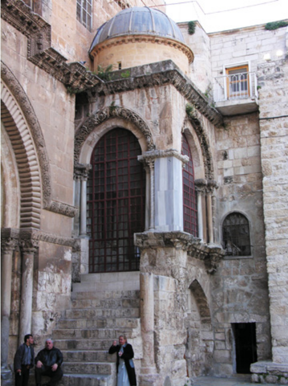
1.12. Church of the Holy Sepulcher, Jerusalem.