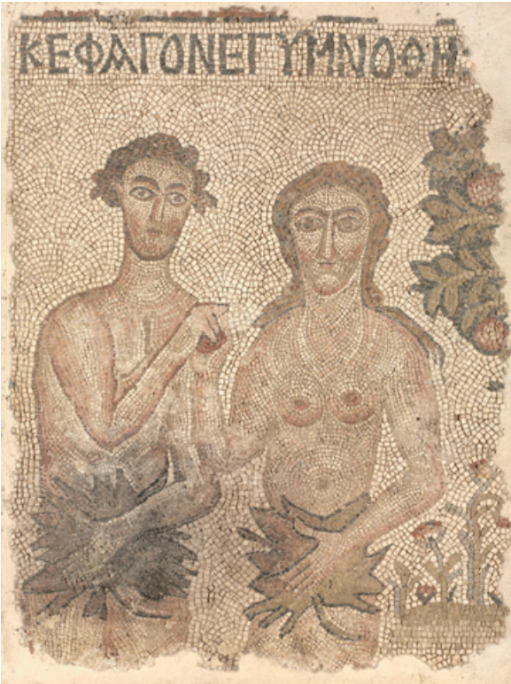
1.11. Fragment of a floor mosaic with Adam and Eve, late 400s to early 500s CE. Northern Syria. Marble and stone tesserae. Cleveland Museum of Art, John L. Severance Fund 1969.115.

and geography begs the question of what “foreign” even means in Byzantium. Objects carried cultural meaning and were markers of affiliation, yet they were often symbols of harmony and continuity as much as difference.