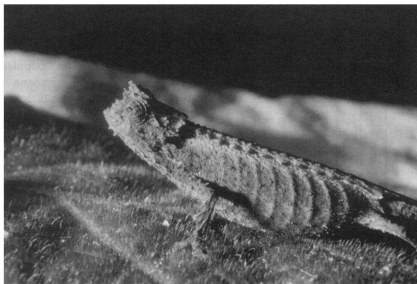
Plate 2 The rarest chameleon at Vatoharanana was Brookesia thieli (J. M. Rowcliffe).

Surveyors (working in teams of two) moved slowly (mean search speed 1.73 m/min) along each transect searching opposite flanks for roosting chameleons with the aid of 'Petzl Mega' head torches equipped with standard (i.e. non-halogen) bulbs. Searching for individuals roosting beneath low-lying vegetation often