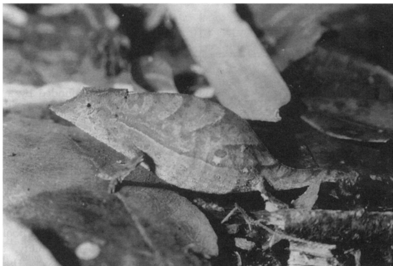
Plate 1 Brookesia nasus , a highly cryptic, ground-dwelling chameleon that is abundant in undisturbed forest within Ranomafana National Park (L. D. Brady).

January 1994), timed to coincide with maximum chameleon activity (Raxworthy, 1988). Chameleon identifications were based on keys, illustrations and descriptive notes in Brygoo (1971, 1978) and Glaw & Vences (1992). Animals were classified as hatchlings, juveniles and adults, and sexed according to size-class and morphology. These data were used to determine the population structure for each species.