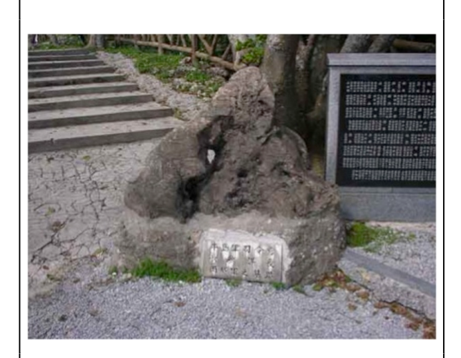
Site commemorating the ritual suicide of Generals Ushijima Mitsuru and Chō Isamu

some of the Chinese tourists, if they see names of Ushijima Mitsuru and Chō Isamu, would be reminded of the Nanjing Massacre.<sup>2</sup> One becomes rather suspicious that the prefecture may have deleted these names for this reason.