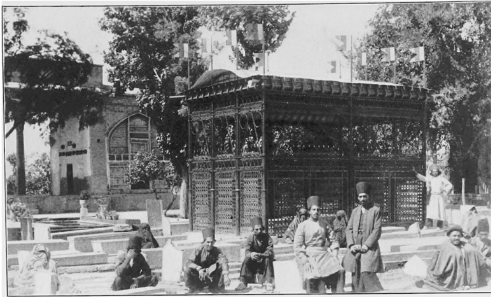
Figure 3. Tomb of Hafez. Public domain. From the book “Persia Past and Present; a Book of Travel and Research, with More than Two Hundred Illustrations and a Map.”

In 1934, when Siroux began the construction of Amjadih Stadium, with an intended capacity of 15,000, Reza Shah approved the design and ordered similar stadiums be built across Iran. 119 Dehkhoda, the writer of Iran’s first encyclopedia, chose verses from the Shahnameh to be placed on tiles around Amjadih Stadium. These verses referenced Zoorkhaneh, which evolved from ancient Mithraic temples as a gathering place for people to engage in sports. 120 This display demonstrates the enduring concept of a communal sports space rooted in Iranian history, now manifested in a modern structure. 121