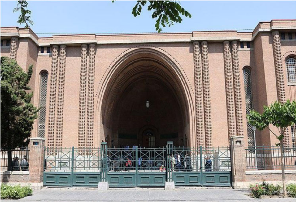
Figure 7. The Ancient Iran Museum. Public domain. From Wikimedia Commons. Photographer: Amir lolohari