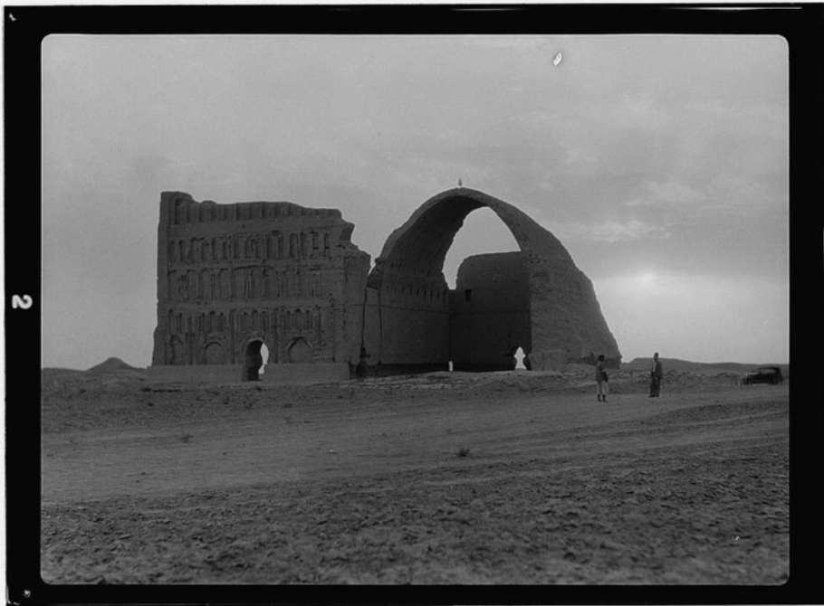
Figure 8. Ctesiphon.