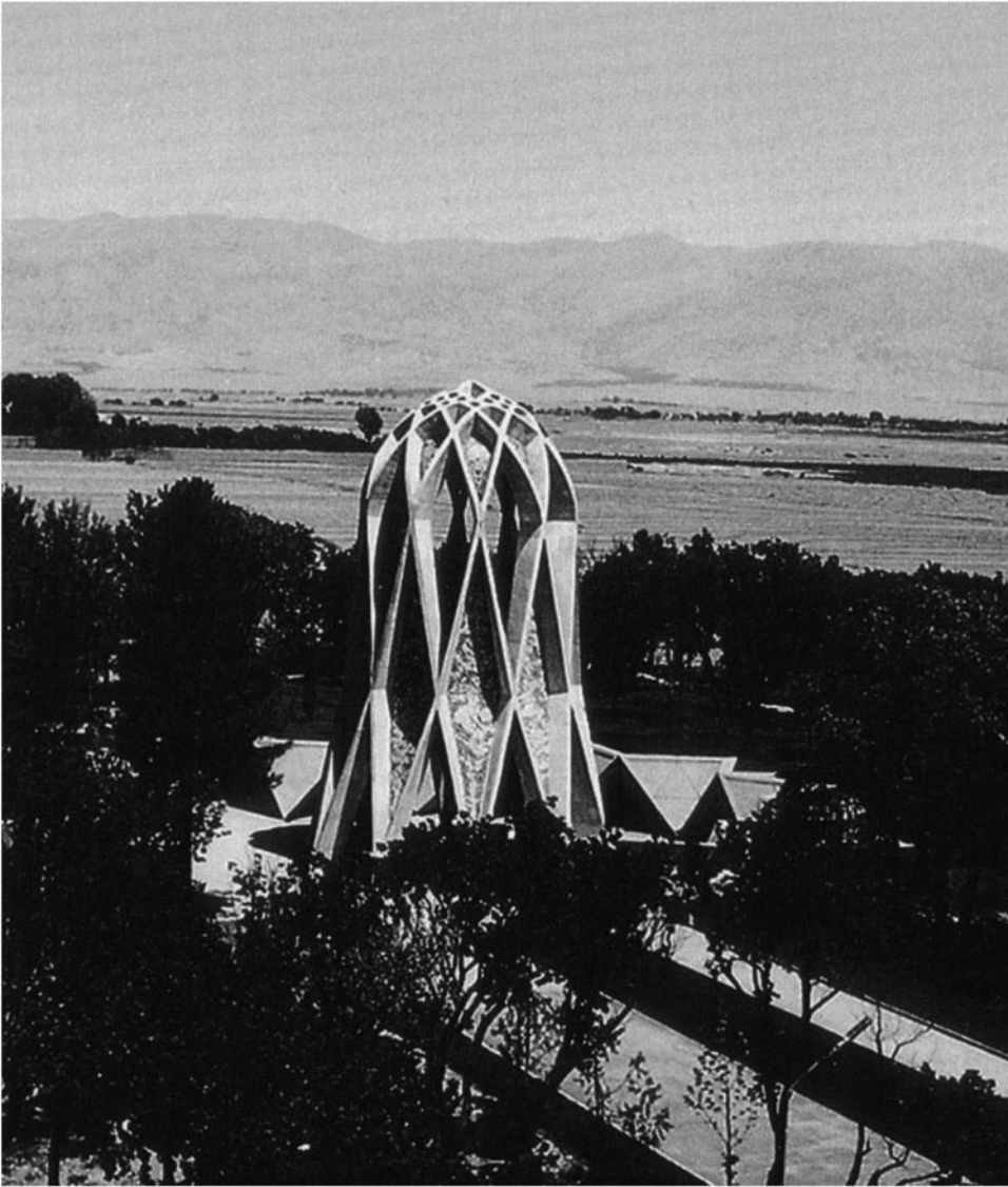
Figure 10. Tomb of Khayyam.