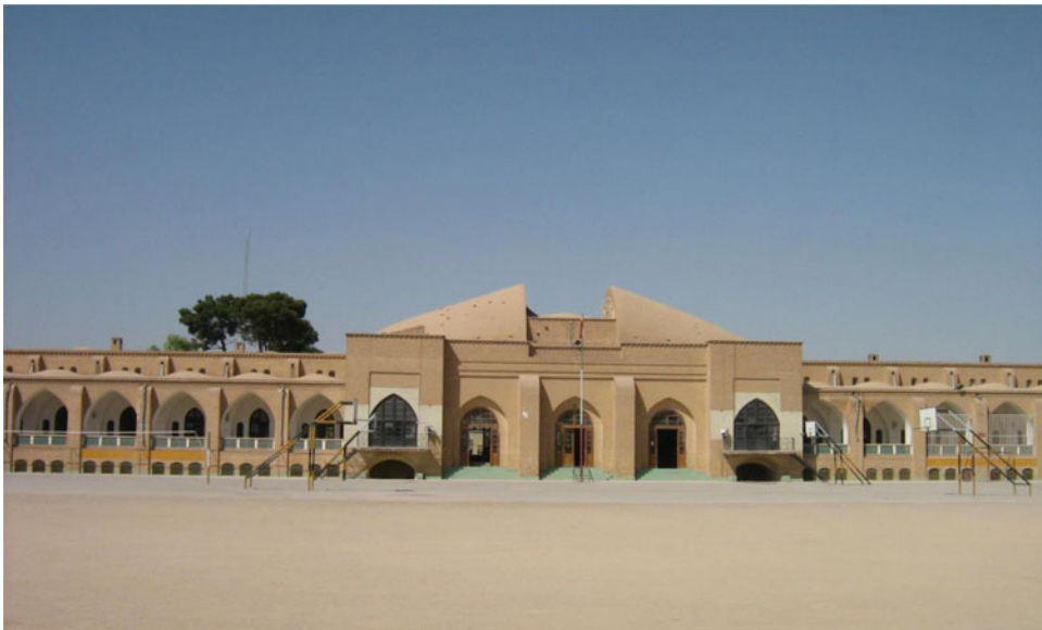
Figure 2. Iranshahr School.

tangible references to local culture. 117 Working consistently across the country, Siroux incorporated local architecture traditions and materials, as exemplified by the Shapur School in Kazeroun. 118