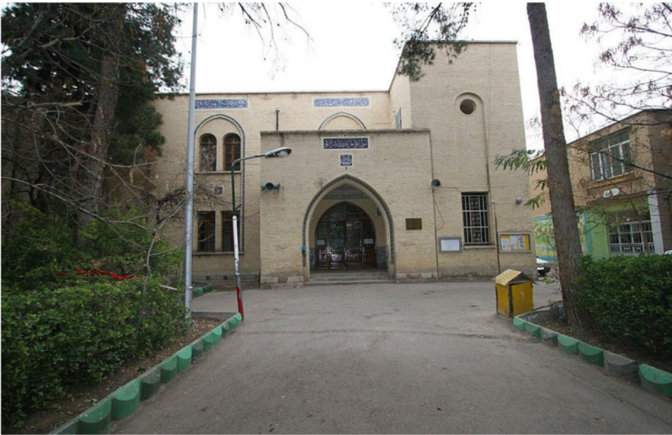
Figure 1. Hakim Nezami School.