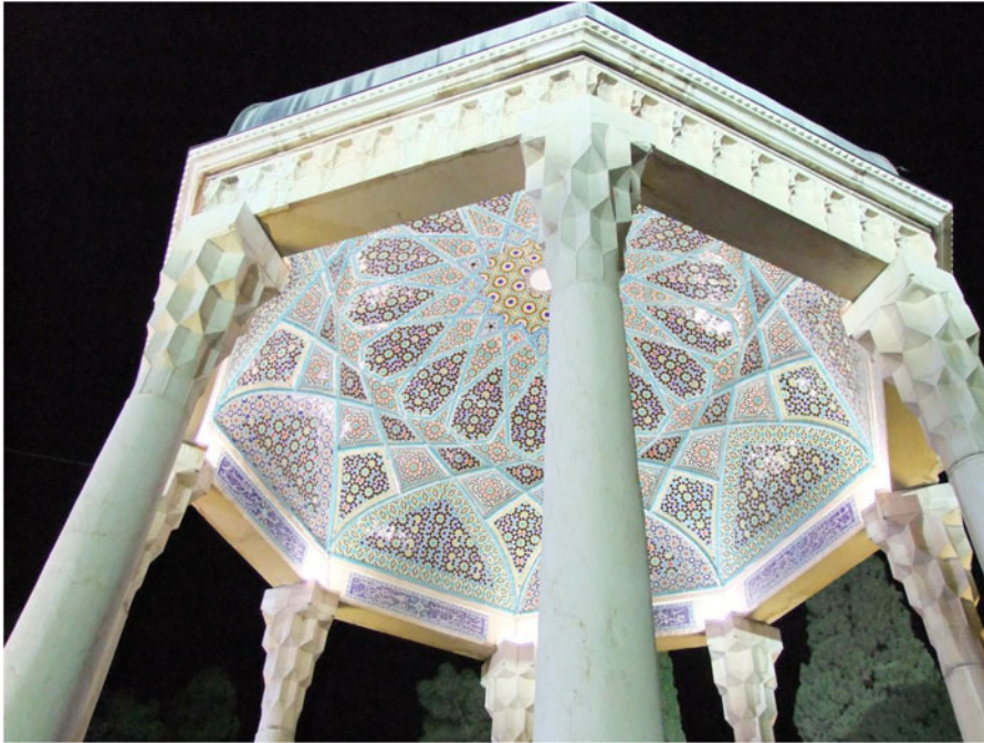
Figure 6. Tomb of Hafez.

the tomb became a library and all the stone fountains placed in the pools were from historical Zand buildings in Shiraz.