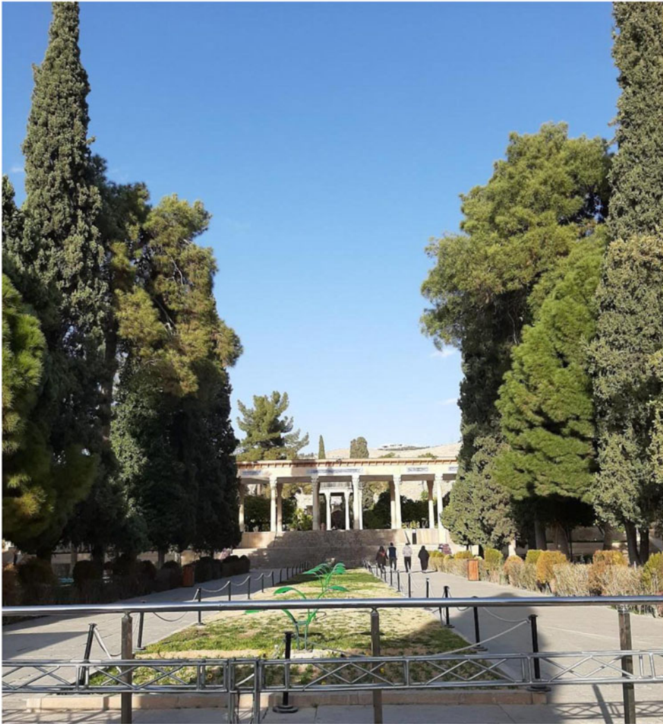
Figure 5. Tomb of Hafez.

(Moaraq) displaying Hafez poems, which indicates a remarkable attention to detail and a deep respect for the past.