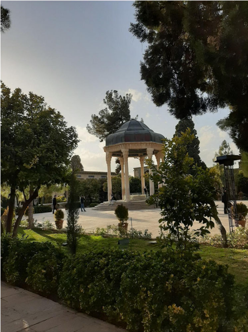
Figure 4. Tomb of Hafez.

The Hafezieh tomb complex included a garden divided into two sections by talar (open-columned halls) measuring 7 by 56 meters (Fig 5). A talar with four stone columns still remained on the site from the Zand era, so Godard extended the hall and added 16 similar stone columns. Thus, the talar became a buffer between the entrance and the tomb monument, providing a gradual shift from the busy sphere of the city to the serene space of the tomb. The symmetrical axis of the Hafezieh entrance matches the axis of the Zand talar and crosses the talar symmetrically, reaching the tomb and mimicking the symmetry of historical Iranian gardens. Two sides of the roof of the talar are decorated with traditional tiles