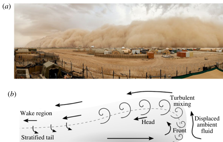
FIGURE 1. (a) Dust storm in Afghanistan (photograph: Cpl Daniel Wiepen; 45158327.jpg from defenceimages.mod.uk, Open Government License nationalarchives.gov.uk/doc/open-government-licence/ ; Crown Copyright 2014), (b) schematic diagram of flow structure in a vertical plane through a turbulent gravity current (delineated nominally by the dashed line; after figures 1(a) and 8 of Sher & Woods (2015)). Density and velocity structure is indicated by shading and bold arrows, respectively.

the front speed is constant but at least 15% less than Benjamin's prediction (Huppert & Simpson 1980; Shin, Dalziel & Linden 2004), the suggested reason being the mismatch between the resulting velocity structure and that assumed in the theory. If a limited volume of source fluid is available to the current, the constant-speed regime (also known as the 'slumping' phase) persists until exhaustion of the source is communicated to the head (see Rottman & Simpson 1983 for details). A second regime follows in which the current is well described by an approximately self-similar dynamical balance between buoyancy and inertia forces, and the front speed u_n decays with time t ( u_n \sim t^{-1/3} , Huppert & Simpson (1980)).