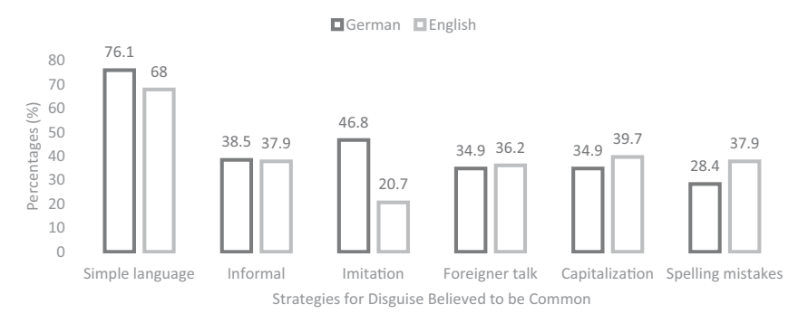
Figure 1. Common forms of disguise.

Other answers, such as 'language without conspicuousness' (comment (18)) exhibit imprecision and vagueness, which is comparable to the answers given in the first study ('I tried to make it mean and demanding', in comment (1) above).