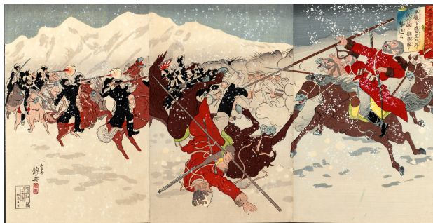
Fighting in the Russo-Japanese War of 1905 in a Japanese conception

Before the war, the Korean Empire announced it would be "neutral" in the conflict. However, Japan ignored the statement and sent advance troops to Incheon two days before declaring war on Russia.