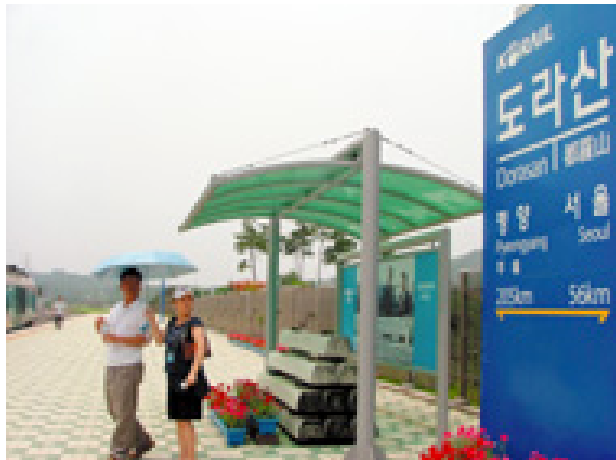
Dorasan, the northernmost station in South Korea on the Gyeongui Line, was constructed five years ago. This view was taken in Paju City.

When I got off the train, a sign on the platform informed me that Seoul lies 56 kilometers to the south and Pyongyang 205 km to the north.