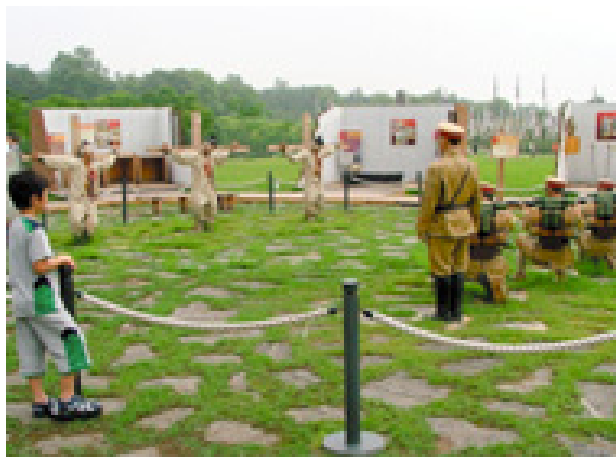
An exhibit at the Independence Hall of Korea in Cheonan City reproducing a scene of Imperial Japanese Army soldiers executing Korean saboteurs of a Japanese-built railway.

"From Korea's point of view, the Imperial Japanese Army brought railways with it, beginning a period of deprivation and oppression. Japan thought the Korean Peninsula was strategically crucial to its military and laid railways as tools to control the peninsula. The Russo-Japanese War was, in a way, a war over railways."