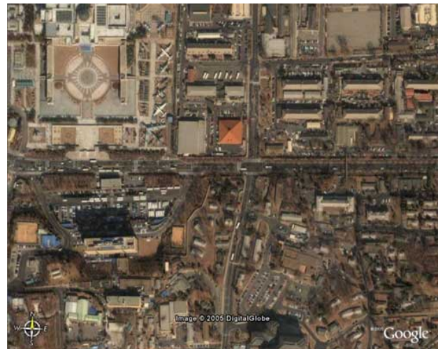
Aerial view of US base at Yongsan/Itaewon

The district to the east of Yongsan Station is blank on Korean maps. Now, a massive U.S. military base occupies the area that is lined with barbed wire, concrete and brick walls along the roads.