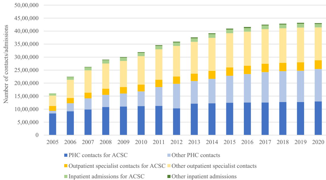
Figure 1. Service utilization among target population from 2005 to 2020.