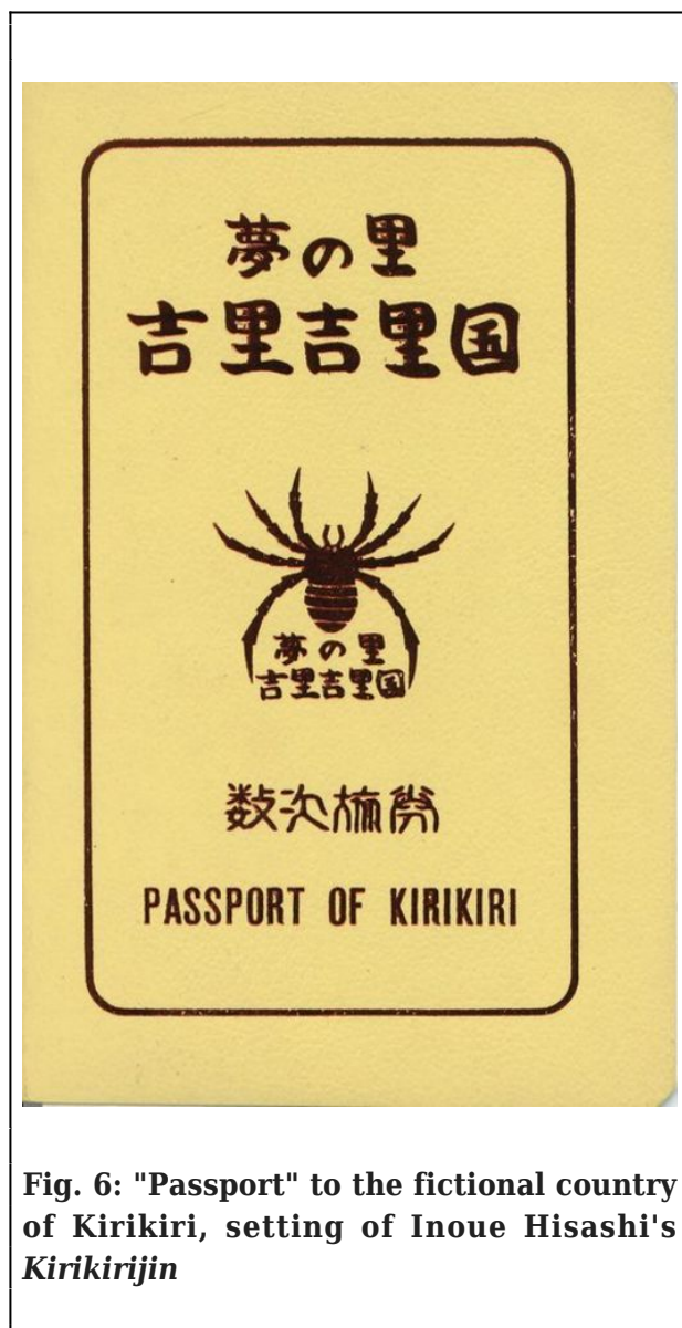
Fig. 6: "Passport" to the fictional country of Kirikiri, setting of Inoue Hisashi's Kirikirijin

However, if this were to come to pass it would lend an odd credence to Inoue Hisashi's 1981 novel, Kirikirijin .