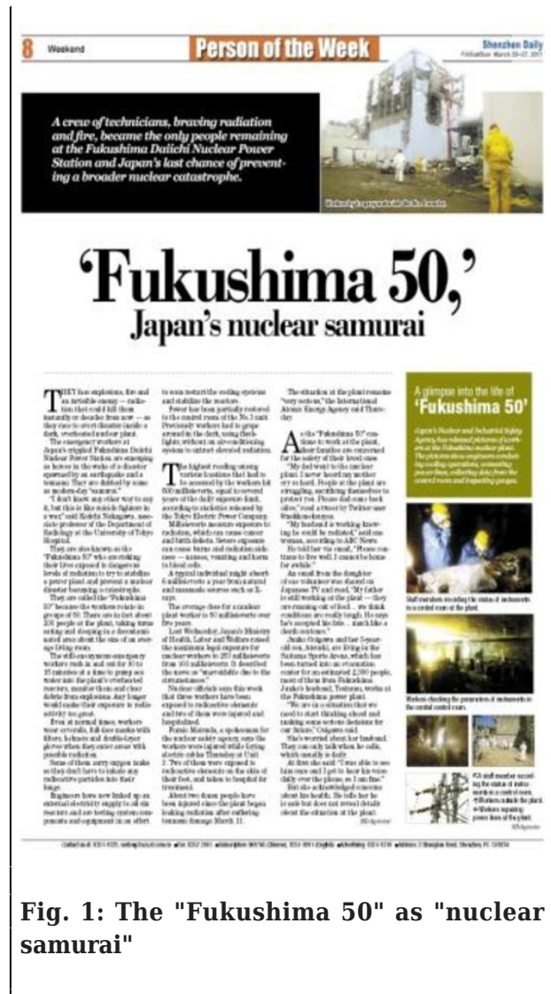
Fig. 1: The "Fukushima 50" as "nuclear samurai"

In the wake of the March 11, 2011 earthquake, tsunami, and nuclear disaster, much has been said about the character of Japan, and especially about Tōhoku and its people. In the early weeks and months, the exceptionally good behavior of an overwhelming majority of Japanese in the face of a disaster of almost unthinkable magnitude was the object of much admiration. Especially in the foreign press, mixed in with cringe-inducing references to the "Fukushima 50" as "nuclear samurai"-if anything, "kamikaze" would have been the more appropriate image-the tropes of "orderly" and "law-abiding" Japanese and "stoic" residents of Tōhoku were repeated frequently even by scholars whose careers are mostly built around combatting sloppy generalizations. Diverse voices from around the world, including those of Chinese netizens-more often cited as a bastion of virulent anti-Japanese sentiment-were joined in approbation. Sympathy and aid poured in from around the world, and the domestic media proudly relayed this news to their Japanese audiences.