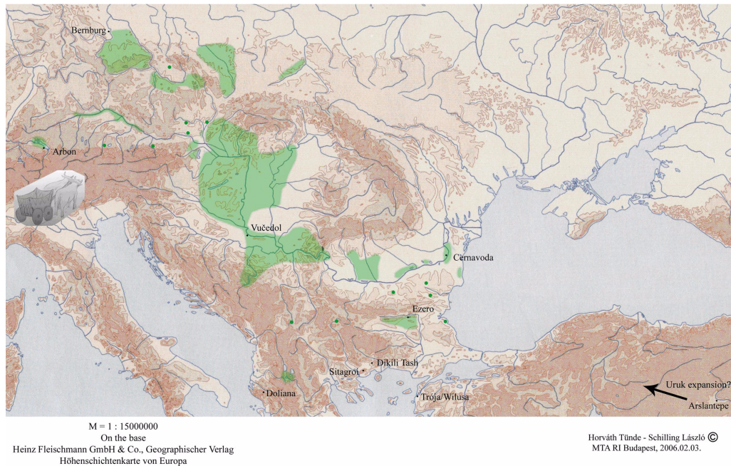
Figure 5 Distribution map of the Baden culture. Prepared by Tünde Horváth and László Schilling, based on the partial maps of Roman (2001).

This superficial unity, especially the uniformity of fine ceramic wares, however, falls apart into local units when we examine the other, local elements of the culture (e.g. burials, stone implements, etc.), which reflect well the distribution of the autochthon populations of the preceding Middle Copper Age (e.g. the Balaton-Lasinja, Ludanice, Pfyn/Horgen or Funnel Beaker cultures). Their distribution became uniform, at least regarding their material culture, during the fast process of the transmission of the technological revolution.