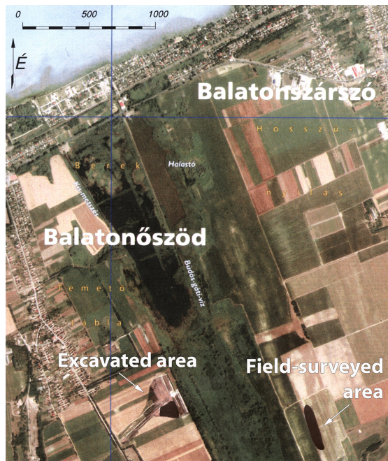
Figure 1 The Balatonőszöd-Temetői dűlő site, the excavated area and its immediate vicinity (prepared by Zsolt Viemann, with the map based on www.szekely.kiado.hu ).

The extent of the settlement of the Baden culture is identical to the boundaries of the excavated area in the east, north, and west; it exceeds it, however, in the south. It is possible that in this unexcavated area the features of phase IV of the Baden culture could have been found. Unfortunately, this archaeologically intact area was destroyed during the construction of the highway (Horváth et al. 2007).