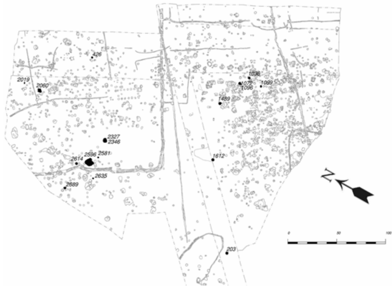
Figure 2 Balatonőszöd-Temetői dűlő. Plan of the excavation and features with samples for ^{14}\text{C} dating. Prepared by Zsolt Viemann.

Stuiver and Polach (1977) and the fractionation correction for \delta^{13}\text{C} is applied. The conventional ^{14}\text{C} age was calibrated with the CALIB 5.01 program (Stuiver and Reimer 1993) using the IntCal04 data set (Reimer et al. 2004). The quality system in the laboratory has been improved and the ISO 9001:2000 standard has been implemented. Participation in several ^{14}\text{C} intercomparison studies (TIRI, VIRI, FIRI) is part of the quality assurance program.