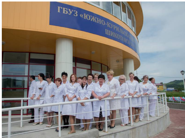
New hospital on Shikotan

because of the profile of the politician (she is health minister), but rather because she did not travel to Kunashir/i or Iturup/Etorofu like the others but instead visited Shikotan. It is also notable that the purpose of her visit was to open a new hospital. This is just one of a series of recently completed infrastructure projects on the islands and a further 70 billion roubles has been allocated for 2016-2025. The central authorities have also just unveiled a policy under which unused land in the Far East will be distributed to Russian citizens. The aim is to encourage economic development and the scheme will apply to the disputed islands. Lastly, in July 2015 Russia's Minister for Far Eastern Development announced plans to increase the number of people living on all of the inhabited Kuril Islands to as high as 24,000 [Kuz'min, 2015]. Evidently, the fact that all of these new schemes extend, not only to Kunashir/i and Iturup/Etorofu, but also to Shikotan does not give encouragement to the idea that Russia is willing to uphold its 1956 commitment.