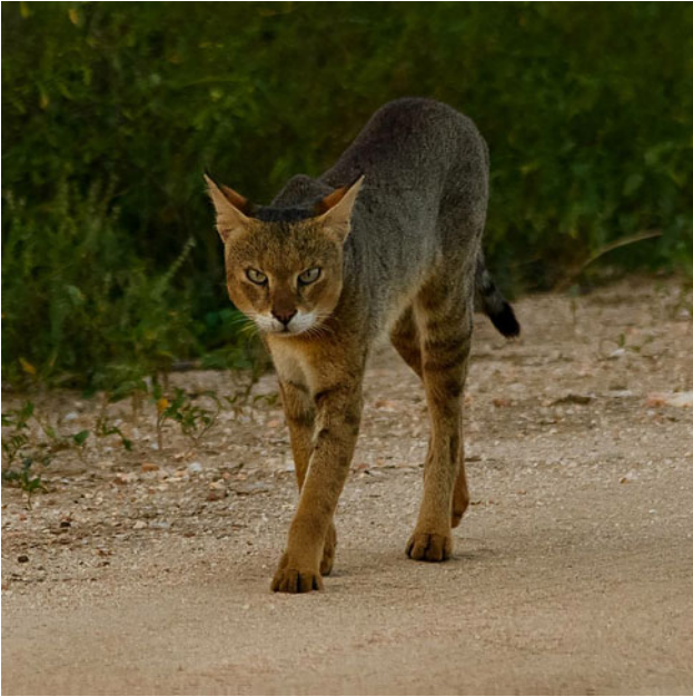
PLATE 1 A sample photograph, provided by a member of the public, taken within Udawalawe National Park, away from any human habitation. We identified this individual as a jungle cat by its long legs, ear tufts, tawny head and part of the legs, most of the body grey, black and white speckled, few stripes on the legs and tail, and plain coat. The practice of hybridizing domestic with wild cats is not known in Sri Lanka (Phillips, 1935; Yapa, 2013) and therefore we are confident this is not a hybrid. Furthermore, this photograph was taken deep within the National Park, where it is unlikely that natural hybridization would occur.

Our finding that the jungle cat occurs both within and outside protected areas parallels studies in Sri Lanka of other carnivores such as the leopard (Kittle et al., 2018), fishing cat (Urban Fishing Cat Conservation Project, 2020) and elephant Elephas maximus (Fernando et al., 2021). However, the presence of these species in human-dominated landscapes can result in negative interactions with people. In 2019, for example, 405 elephants (Prakash et al., 2020), 12 leopards (A. Kittle, pers. comm., 2021) and 22 fishing cats (Small Cat Advocacy & Research, 2020) were killed as a result of human–wildlife interactions. Research is required to investigate whether the jungle cat is also affected in this way.