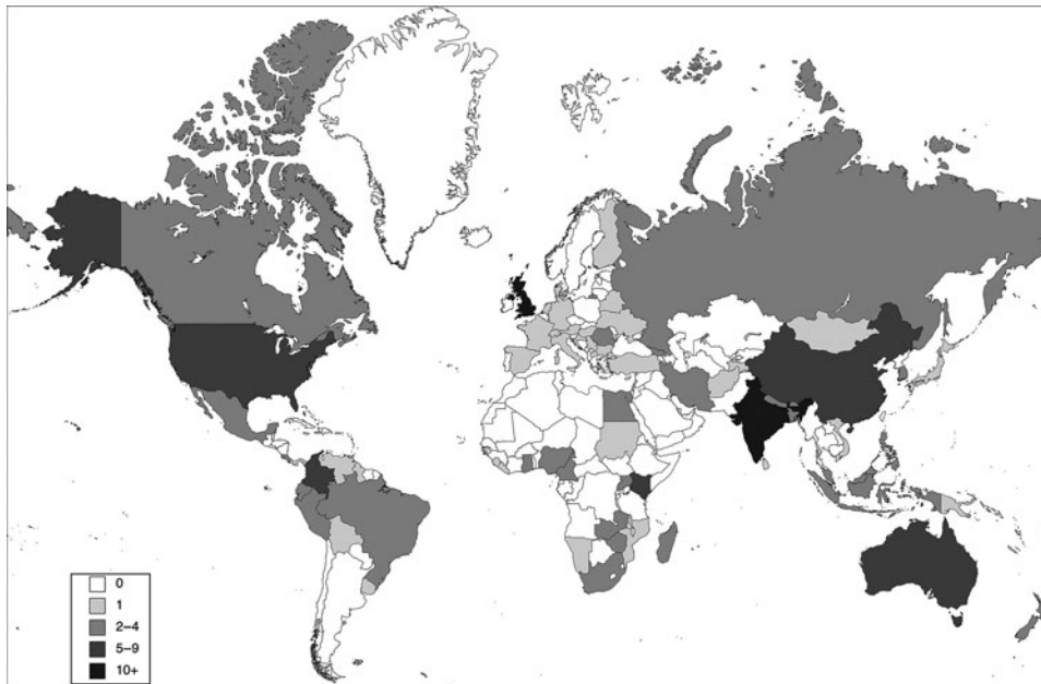
FIG. 1 The origin of all 181 Cambridge Masters in Conservation Leadership students from 2010–2011 to 2019–2020, with the shade indicating the number of students from each country.

which the programme was able to deliver a rewarding learning experience: