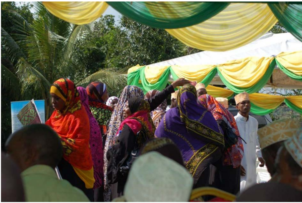
PLATE 1 The celebration for the 18 shehia with registered Community Forest Management Agreements at the close of the Hifadhi ya Misitu ya Asili programme project, attended by the President of the Revolutionary Government of Zanzibar and representatives from the Royal Norwegian Embassy and CARE International (Pemba, August 2015; photo: M. Borgerhoff Mulder).

primarily from high transaction costs associated with the technical complexities of constructing cloud-free satellite images as a forest cover baseline.