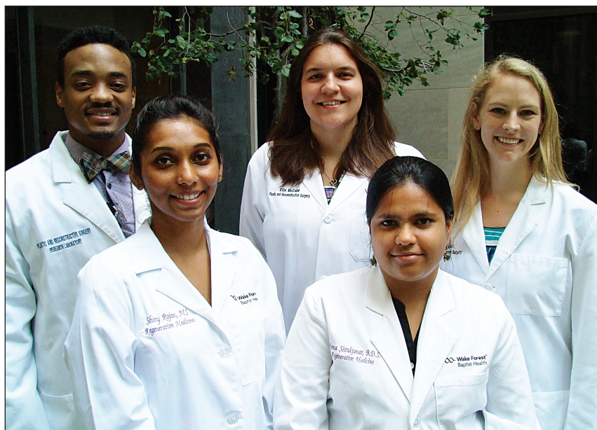
The AuTACA team, a startup from Wake Forest School of Medicine and winner of the NSC2 Innovation Excellence Award administered by the Center for Advancing Innovation and NIH.

Startup incubators and business accelerators have been playing an important role in helping to spur innovation and support nanotechnology entrepreneurs. For example, Y Combinator, a Bay Area incubator, provides seed funding and support for early-stage startups with the goal of helping them build a compelling business case to attract larger funding from later-stage investors. Y Combinator runs two 3-month funding cycles per year. During each cycle, they encourage the founders of each startup they fund to relocate to the Bay