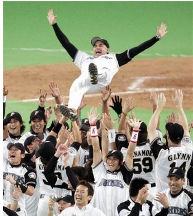
ICCND October, 2008 meeting

The issue of nuclear war and nuclear disarmament have repeatedly been submerged in recent years by issues of terrorist attack and wars such as those in the Congo, Rwanda, Afghanistan, Iraq and Gaza. But as former Foreign Minister Gareth Evans recently pointed out at the October meeting of the Australia-Japan International Conference on Non-Proliferation and Disarmament, "The truth of the matter is that there are at the moment, depending on how you calculate these things, somewhere between 13,000 and 16,000 nuclear warheads actively deployed, a great many of them still on hair-trigger alert even though the Cold War has been long over. And between them having a phenomenal destructive capability. The reality also is that we are on the brink - after years and years of containing rather well the emergence of new nuclear weapon states, with all the risks of either deliberate or accidental use of nuclear weapons that flows from the existence of nuclear weapons or nuclear arms proliferation . . ."