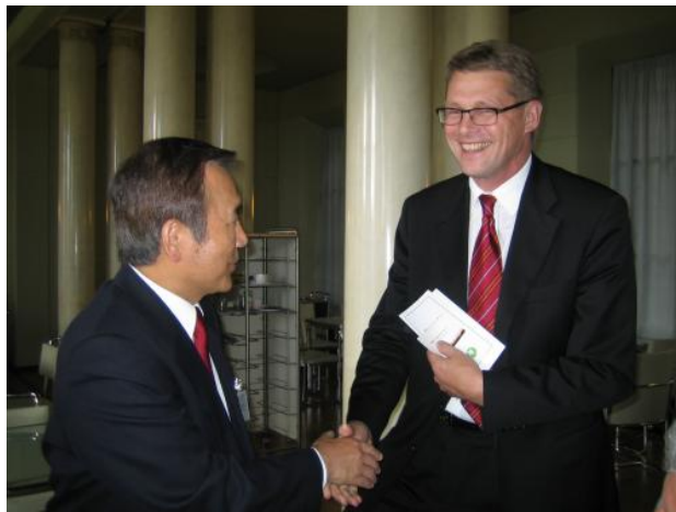
Hiroshima Mayor Akiba Tadatoshiki with Prime Minister of Finland promoting Peace 2020

Moreover, the comments made by MOFA at the Christmas Eve meeting were consistent with existing efforts to eliminate nuclear weapons, such as the Mayors for Peace 2020 Vision, an initiative supported by 236 cities in 134 countries and regions of the world to abolish all nuclear weapons. MOFA's comments also reflected the Japanese government's recognition of the legitimacy of the Article VI of the Nuclear Non-proliferation Treaty that calls for complete nuclear disarmament. Speaking for herself, Ms. Kawaguchi criticized the nuclear deal recently struck between the United States and India.