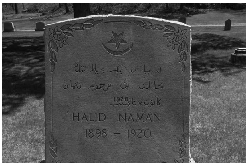
Figure 3. A Turkish grave in Cedar Grove Cemetery in Peabody, MA. The American headstone carvers were able to carve Ottoman script by imitating the handwriting of the Turks. The Ottoman script on the gravestone suggests that Halid Naman came from Diyarbakir vilayeti (Diyarbakir province).