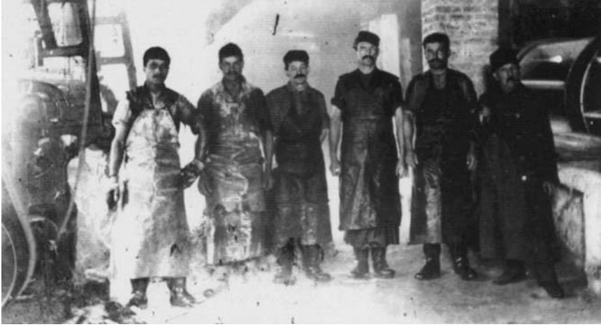
Figure 4. One of Peabody's beam houses in 1920s. The people are identified as European immigrants. My belief is that many of them are either Turks or Greeks, who were heavily employed in the beam house.

From Quinn, Peabody's Leather Industry; reproduced with permission.