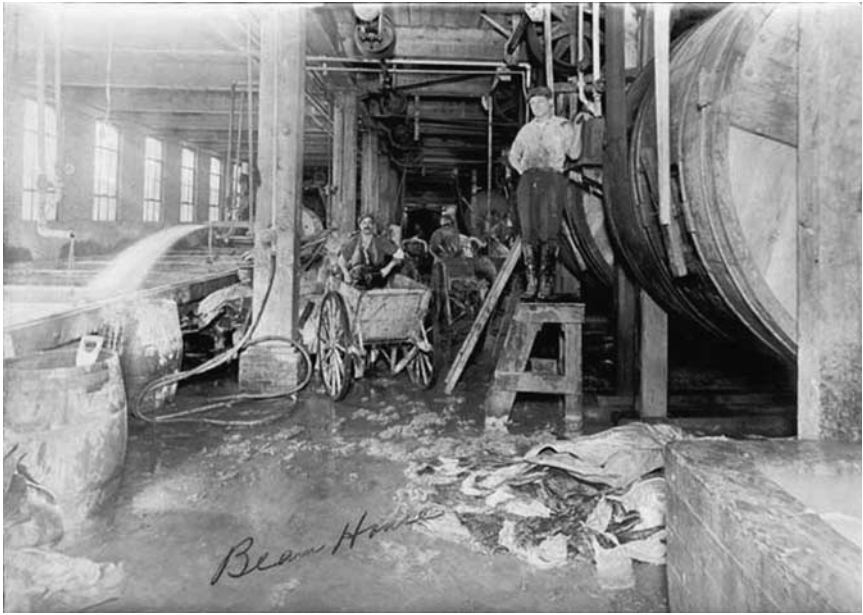
Figure 1. Boston Mat Leather Company's beam house, located on Walnut Street, Peabody, MA, 1919.