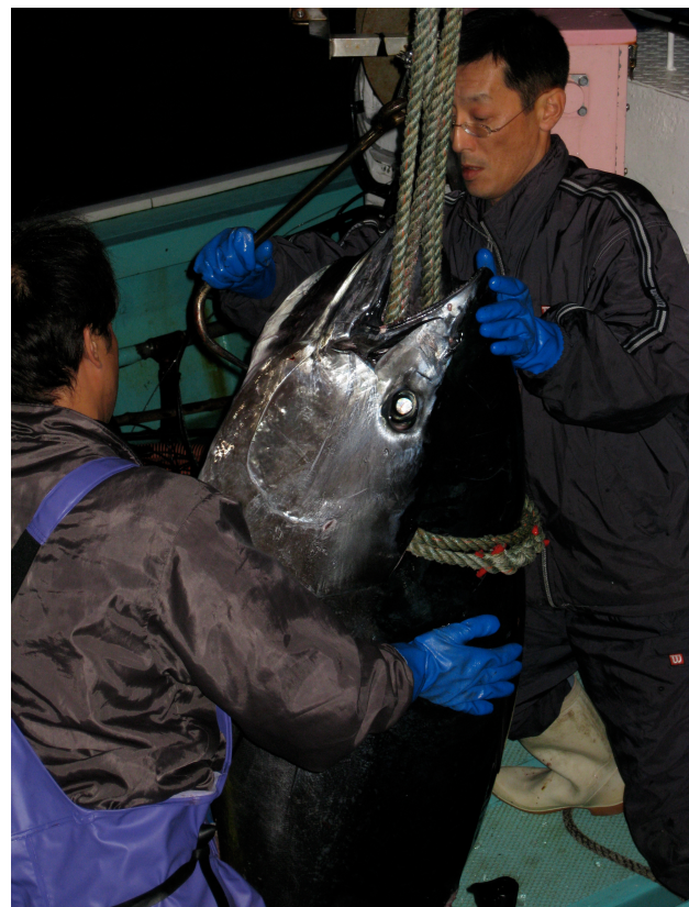
Bringing in a tuna in Oma

By the time it is carved up and sold as thousands of sushi, sashimi and steak cuts to restaurants across the city, it will be worth at least three times that much -- the price of a luxury family car. In 2001, a 202-kg fish caught off Oma, a town of 6,000 people of the northern coast of Aomori Prefecture famous for producing the tastiest tuna in Japan, a single bluefin sold for a record 20.2 million yen.