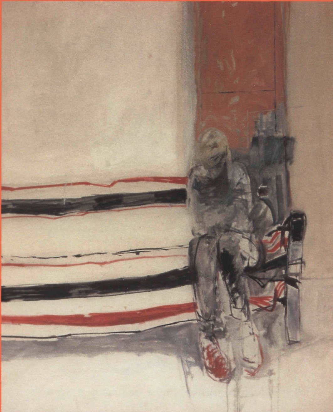
'Anna on a Sofa' (1965) by Basil Blackshaw (oil on canvas, 122.5 x 122.5cm) From an exhibition at the Irish Museum of Modern Art, Royal Hospital Kilmainham, Dublin 8. (The Gordon Lambert Trust Collection) 22 January - 23 June 2002