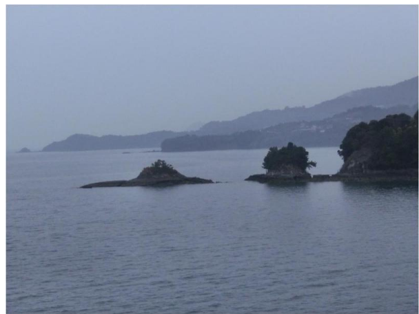
Minamata Bay in winter.