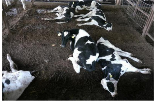
Starving cows in Fukushima

[ Gotagai ] doesn’t mean simply that we humans rely upon each other for our existence but that plants and animals are also partners in this life. Gotagai includes the sea, the mountains, everything. Human beings are part of the circle of gotagai ; we owe our existence to the vast web of interrelationships that constitute life. 64