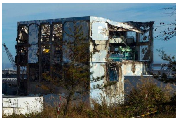
Fukushima Daiichi Reactor No.4, May 2012.

Experts fear that a catastrophe on an even larger scale could still occur. Koide Hiroaki, a nuclear scientist at Kyoto University, warns that Japan 'will be finished' if approximately 300 tons of spent nuclear fuel (4,000 times the size of the Hiroshima atomic bomb) kept at the spent-fuel pool in the badly damaged No. 4 reactor building, release radiation as a result of a cooling failure caused by, for instance, another earthquake. 11 If this happens, the entire Fukushima nuclear complex will become inaccessible, leading to radioactive emissions on a cataclysmic scale, perhaps 85 times as great as Chernobyl. 12 TEPCO reported previously that as of March 2010 there were 1,760 and 1,060 tons of uranium at Fukushima Daiichi and Daini, respectively. 13 A simple calculation, based on Koide's estimate above, suggests that this is equivalent to 28,000 Hiroshima bombs. A 'chain reaction' involving all six reactors and seven spent fuel pools at the complex was envisioned as the 'worst case scenario' by Kondo Shunsuke, Chairman of the Japan Atomic Energy Commission, in his report submitted to the government two weeks after March 11. The report, which was suppressed by the government, concludes that if the 'chain reaction' happens, the exclusion zone may have to be greater than 170km. 14 Tokyo is 220km away from the plant. Kondo's report thus is largely consistent with Koide's prediction, although they hold opposite positions on the question of nuclear power generation.