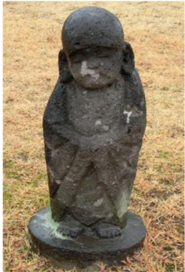
A Stone Buddha on the reclaimed land in Minamata.