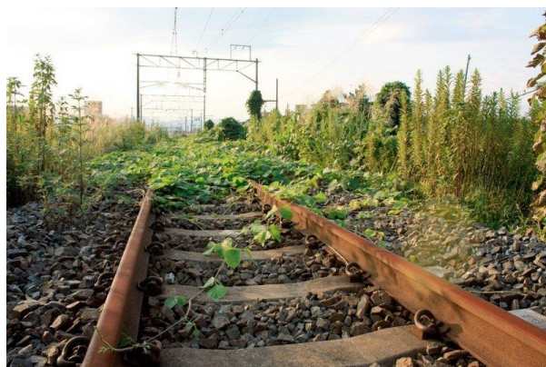
Namie became a ghost town

The crisis in Fukushima is even more serious in many respects. In Fukushima, the level of devastation is extremely high, and as at August 2012, approximately 111,000 people have been forced to evacuate by the government with no or limited prospects of returning to their homes. 35 The impact of the nuclear crisis is global rather than regional, and in respect of the ecosystem, it is not yet possible to determine its ultimate impact. The underlying power structure of the Japanese 'nuclear village' is more formidable than that of Chisso. Its power is reinforced by close links to the international nuclear regime. The causal link between exposure to the poison and illness is much harder to establish in the case of irradiation: low level irradiation does not result in distinctive symptoms as in Minamata disease; it takes many years to manifest as cancer, the cause of which is difficult to single out; and impact upon the unborn, infants and young children is unknown.