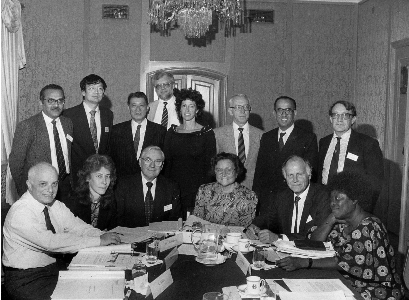
FIGURE 6.6 First board meeting in September 1989 of the Stockholm Environment Institute, which has since its establishment consistently ranked as one of the world's top environmental think tanks. Most of the original staff and leadership of the Institute, as well as the network of SEI satellite centers outside Sweden, were inherited from the original Beijer Institute.

left the Academy for new premises in Stockholm's Old Town, SEI also absorbed the Beijer Institute's international network, including its centers in York and Boston. Since the establishment of SEI, new centers and satellite offices have been opened in Tallinn, Bangkok, Bogotá, Nairobi, Oxford, Seattle, and Davis, California.