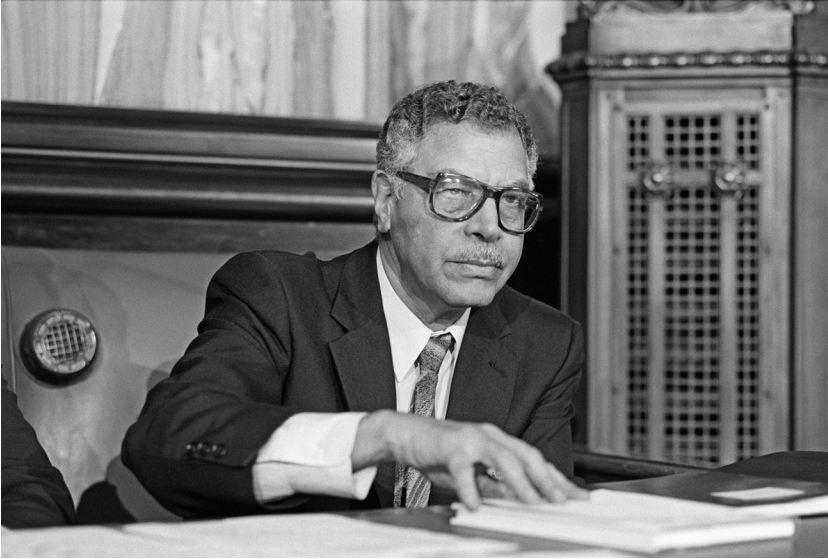
FIGURE 6.2 As Executive Director of the United Nations Environment Programme from 1975 to 1992, the Egyptian scientist Mostafa Tolba played a key role in the promotion of the science and politics of ozone and climate, including the 1985 Vienna Convention for the Protection of the Ozone Layer and the establishment of the Intergovernmental Panel on Climate Change in 1988.