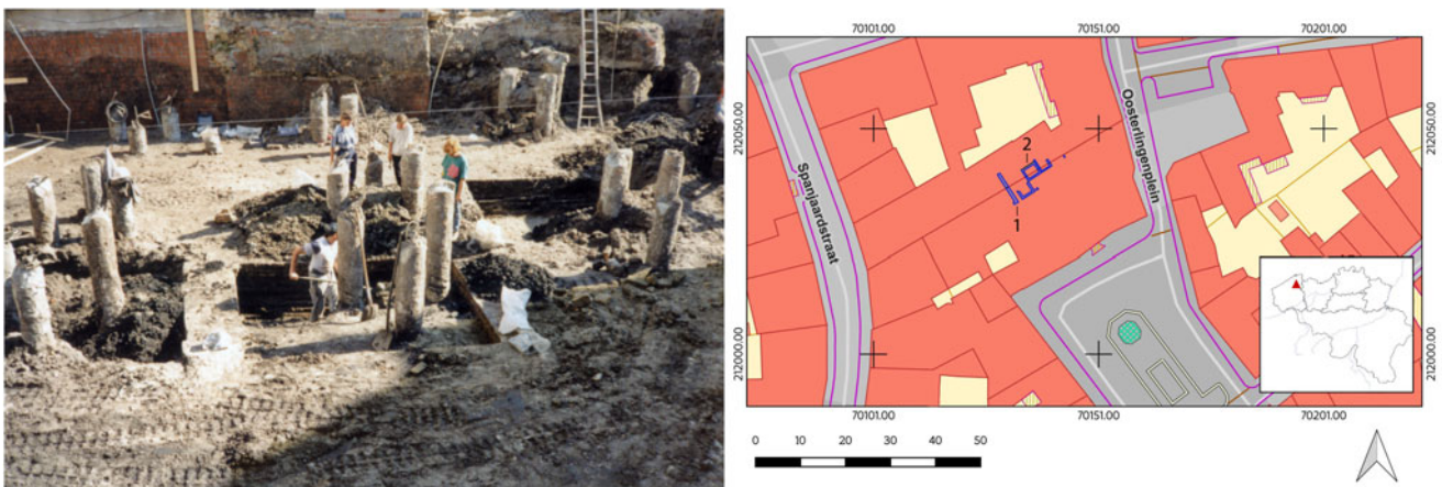
Figure 2. Photo showing excavation site with studied latrine in the centre of the picture (left). Plan of the excavated structures (right); back wall of the Spanish nation house (1) and studied latrine (2).

falls within the overlapping size range of T. suis (46.6–71.2 by 25–37.5 \mu\text{m} ) (Beer, 1976). Given that the material studied was from a human latrine these eggs are most likely T. trichiura , however, we cannot definitively determine the species based on morphology. One trematode egg was identified based on its morphology, and its size is consistent with that of either F.