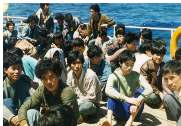
Fujian undocumented migrants on the deck of a fishing boat.

Accompanying payment for the visa, there were also extra costs was associated with pooling money. Only a few families already had members working abroad and therefore could afford the initial costs. Most immigrant families borrowed at high interest (usually 1 percent every month) or obtained loans through rotating credit associations. Many Fujian students had to quit school and become visa-overstayers because of the financial burden.