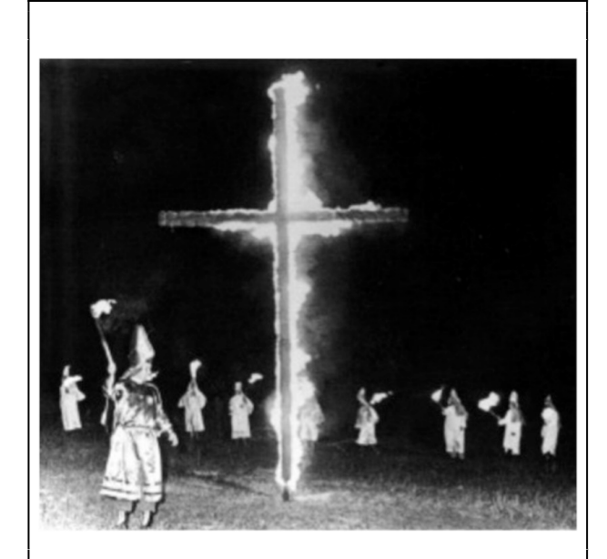
Ku Klux Klan violence in the 1960s was checked by the FBI -- also using violence